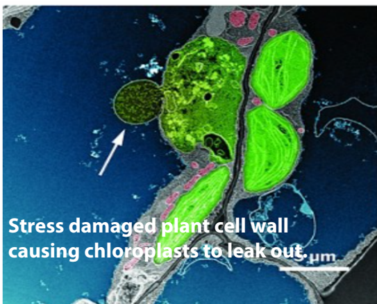
Stress damaged plant cell wall causing chloroplasts to leak out. \mu\text{m}